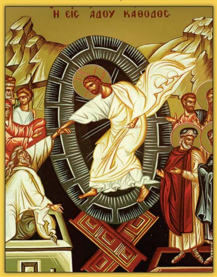
Icon of the Descent into Hades